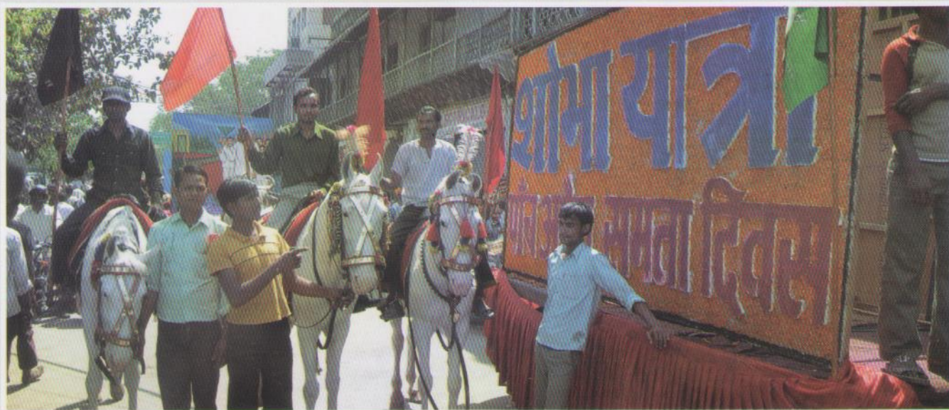
A Photo of Sobha Yatra organized on the occasion of Birth Anniversary of Babu Jagjivan Ram on 05.04.211