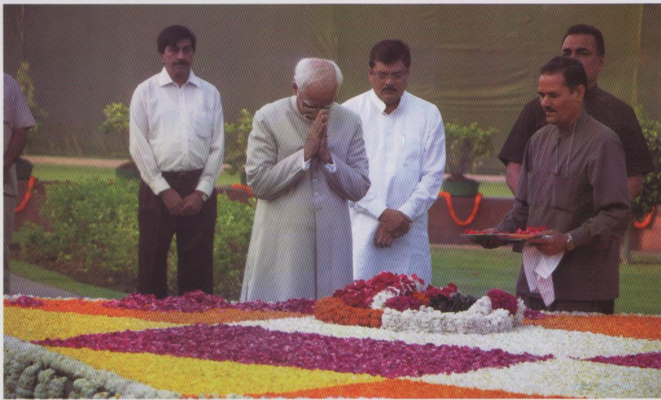
His Excellency Vice- President of India Shri Mohd. Hamid Ansari and Hon'ble Minister for Social Justice & Empowerment and President Babu Jagjivan Ram National Foundation Shri Mukul Wasnik paying homage to Babu Jagjivan Ramji at Samta Sthal, New Delhi - 5 April, 2011.