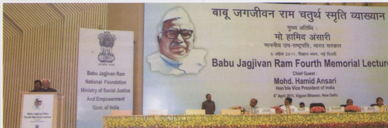
Hon'ble Vice President of India, Shri M. Hamid Ansari delivering The Babu Jagjivan Ram Memorial Lecture at Vigyan Bhawan, New Delhi on 06.04.2011.