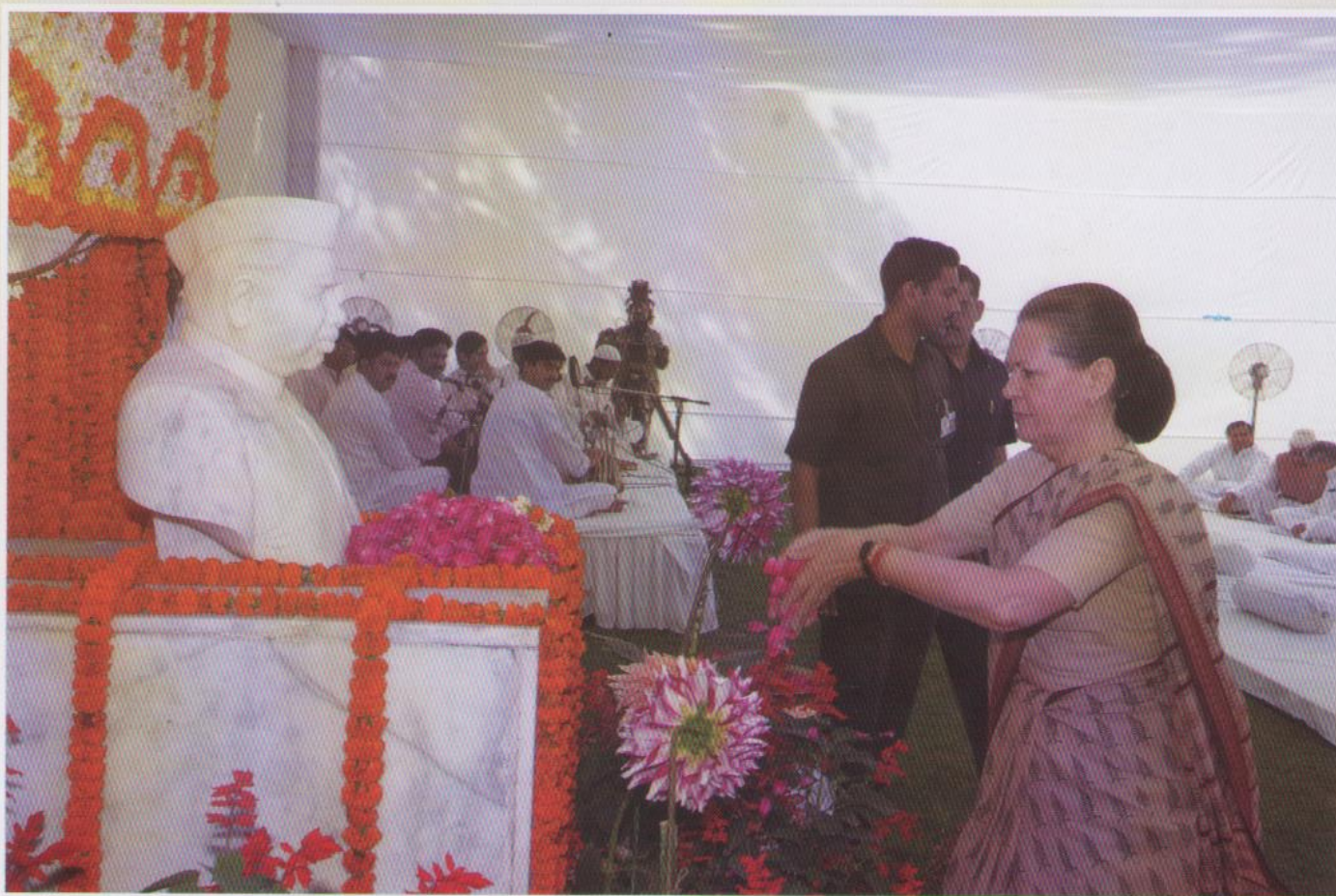
Hon'ble Chairperson, UPA, Smt. Sonia Gandhi paying homage to Babu Jagjivan Ramji at 6, Krishna Menon Marg, New Delhi- 5 April, 2011.