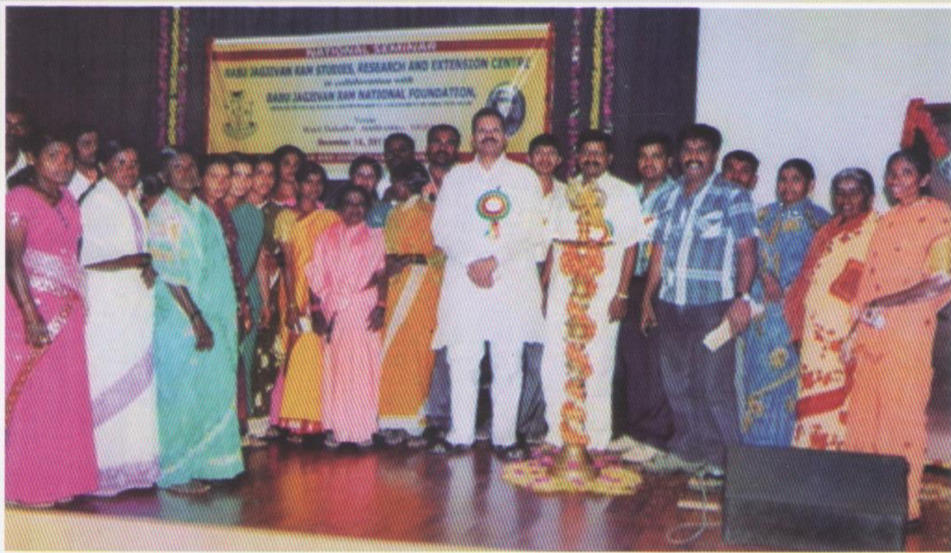
A photo from the Babu Jagjivan Ram Memorial National Seminar on "Relevance of Thoughts of Babu Jagjivan Ram in Modern Society" at Rani Bahadur Institute of Management Sciences, University of Mysore. Mysore 16.12.2011