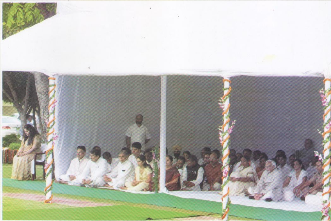
Hon'ble Vice President Shri M. Hamid Ansari; Hon'ble Speaker, Lok Sabha, Smt. Meira Kumar; Minister of SJ&E / President (BJRNF), Shri Mukul Wasnik; Hon'ble Minister for Parliamentary Affairs, Shri Pawan Kumar Bansal and other dignitaries paying homage to Babu Jagjivan Ram at Samta Sthal, the Samadhi of Babuji at New Delhi on his Death Anniversary on 06.07.2011.