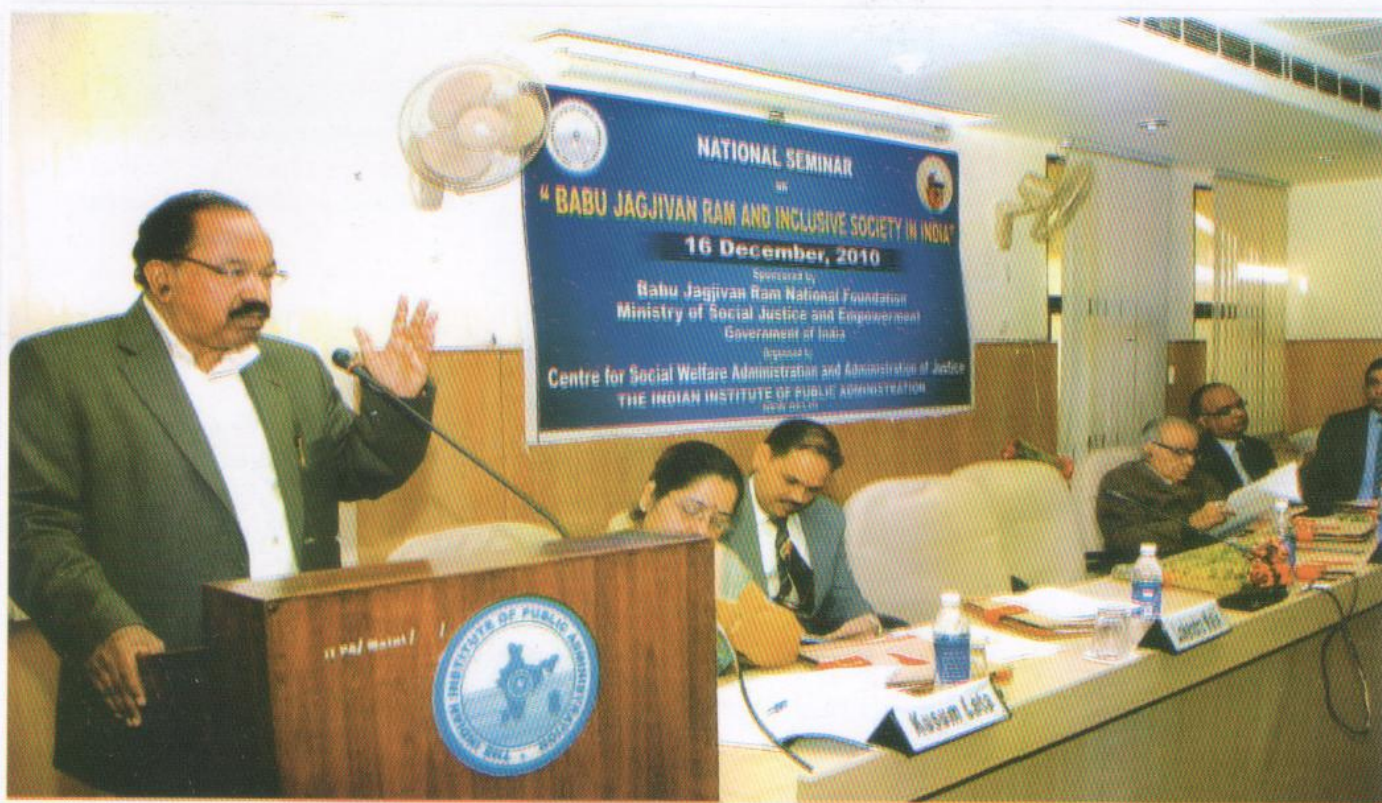
Hon'ble Minister Shri M. Veerappa Moily inaugurating the Babu Jagjivan Ram National Seminar, at Indian Institute of Public Administration, New Delhi - 16 Dec., 2010