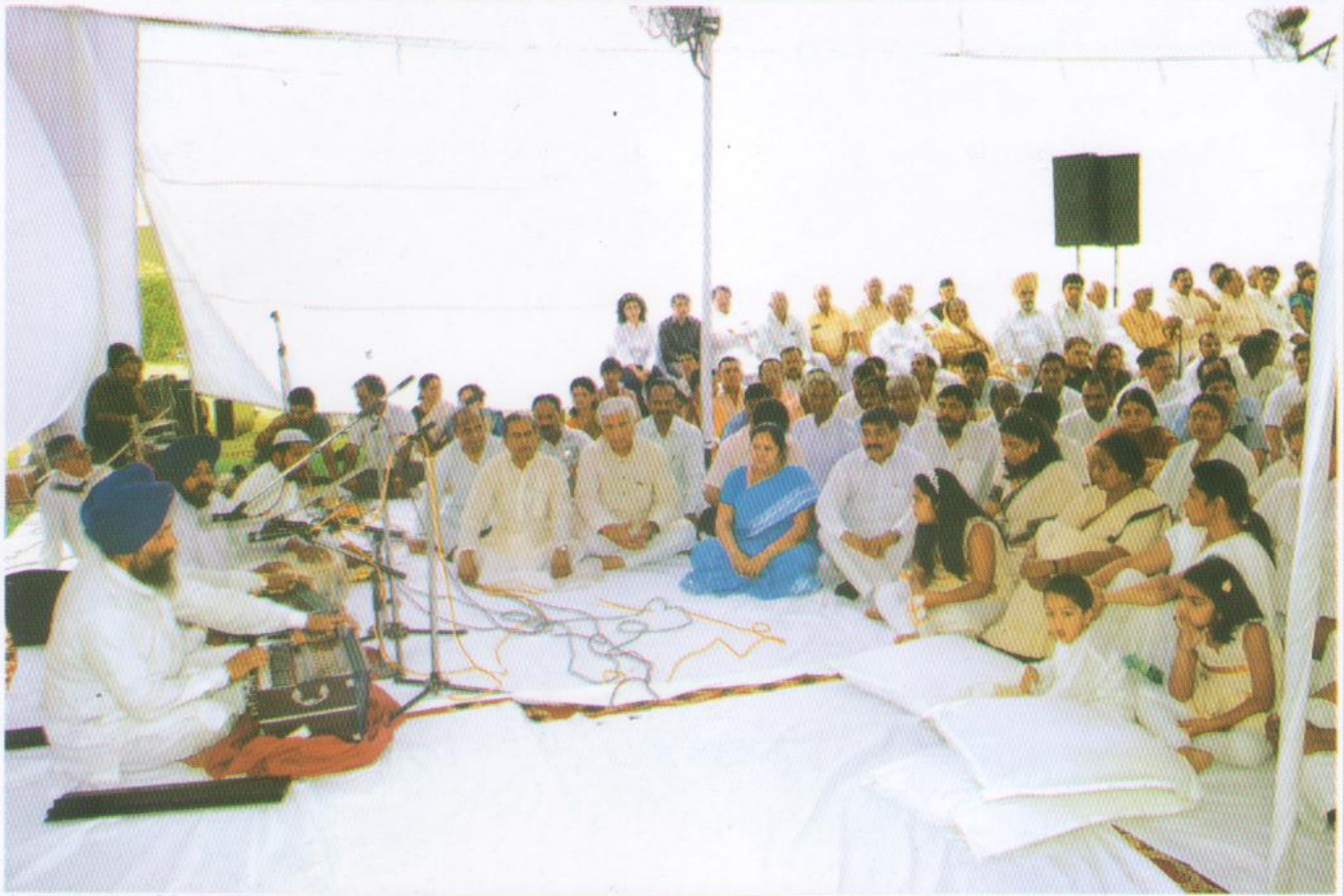
Sarva Dharma Prarthana Sabha at 6, Krishna Menon Marg, New Delhi - 5 April, 2010.