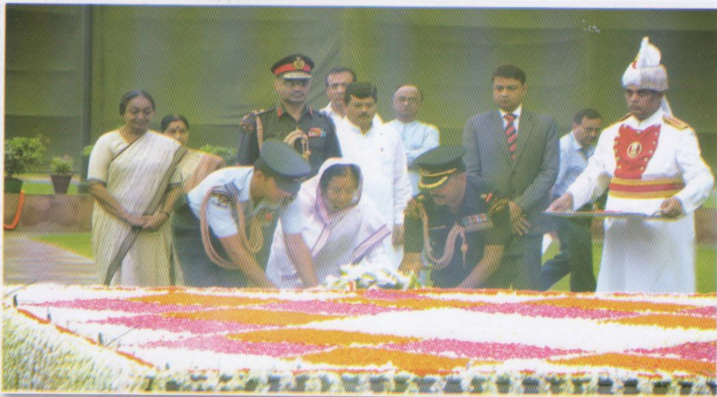
Hon'ble President of India, Smt. Pratibha Devisingh Patil, Hon'ble Speaker, Lok Sabha, Smt. Meira Kumar, Leader of Opposition in Lok Sabha, Smt. Sushma Swaraj, Hon'ble Minister for SJ&E/ President BJRNF, Shri Mukul Wasnik, paying homage to Babu Jagjivan Ramji on his death anniversary at Samta Sthal, New Delhi - 6 July, 2010.

Smt. Meira Kumar, Leader of Opposition in Lok Sabha, Smt. Sushma Swaraj, Hon'ble Minister for SJ&E/ President Babu Jagjivan Ram National Foundation, Shri Mukul Wasnik, Minister of State, SJ&E Shri D. Napoleon, Chief Minister of Delhi, Smt. Sheila Dixit and many other prominent dignitaries paid floral tributes to Babuji at his Samadhi in New Delhi. Besides them a large number of social activists and followers of Babuji also paid floral tributes to him.