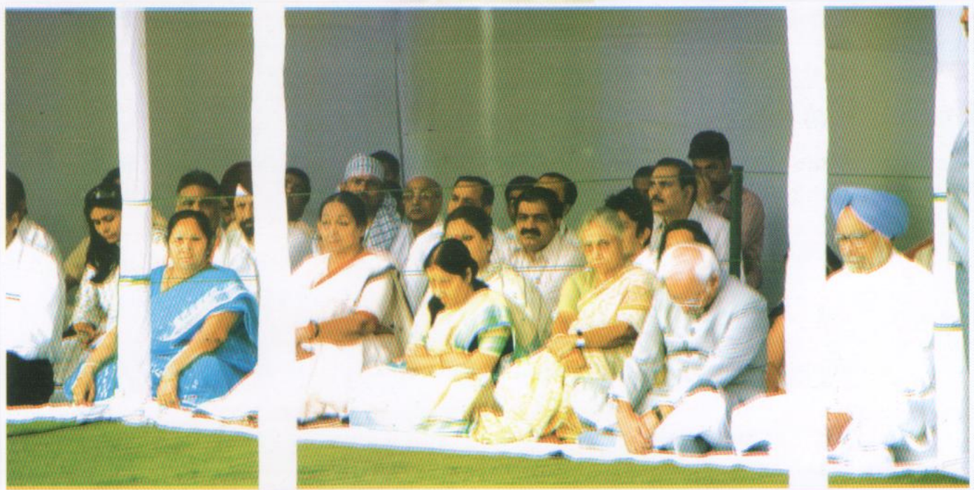
His Excellency Vice- President of India Shri Mohd. Hamid Ansari, Hon'ble Prime Minister Dr. Manmohan Singh, Hon'ble Speaker, Lok Sabha Smt. Meira Kumar, Leader of Opposition in Lok Sabha, Smt. Sushma Swaraj, Chief Minister of Delhi, Smt. Sheila Dixit paying homage to Babu Jagjivan Ramji at Samta Sthal, New Delhi - 5 April, 2010.