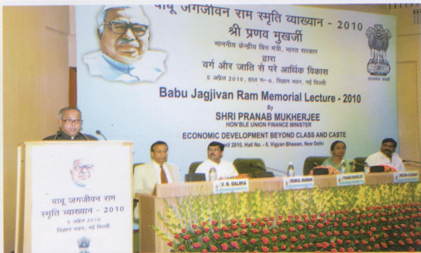
Hon'ble Union Minister of Finance Shri Pranab Mukherjee delivering third Babu Jagjivan Ram Memorial Lecture at Vigyan Bhawan, New Delhi - 5 April, 2010.